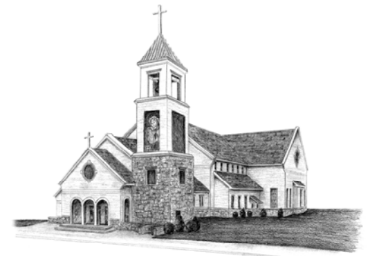
Saints John and Paul Church, Sewickley, Pennsylvania